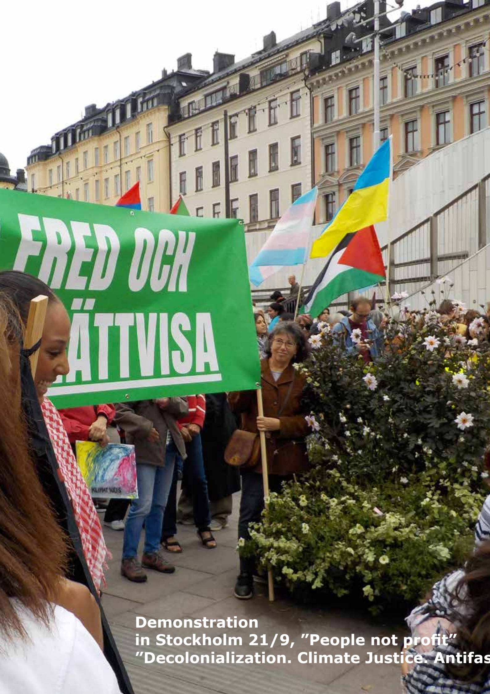
Demonstration in Stockholm 21/9, "People not profit" "Decolonialization. Climate Justice. Antifas"