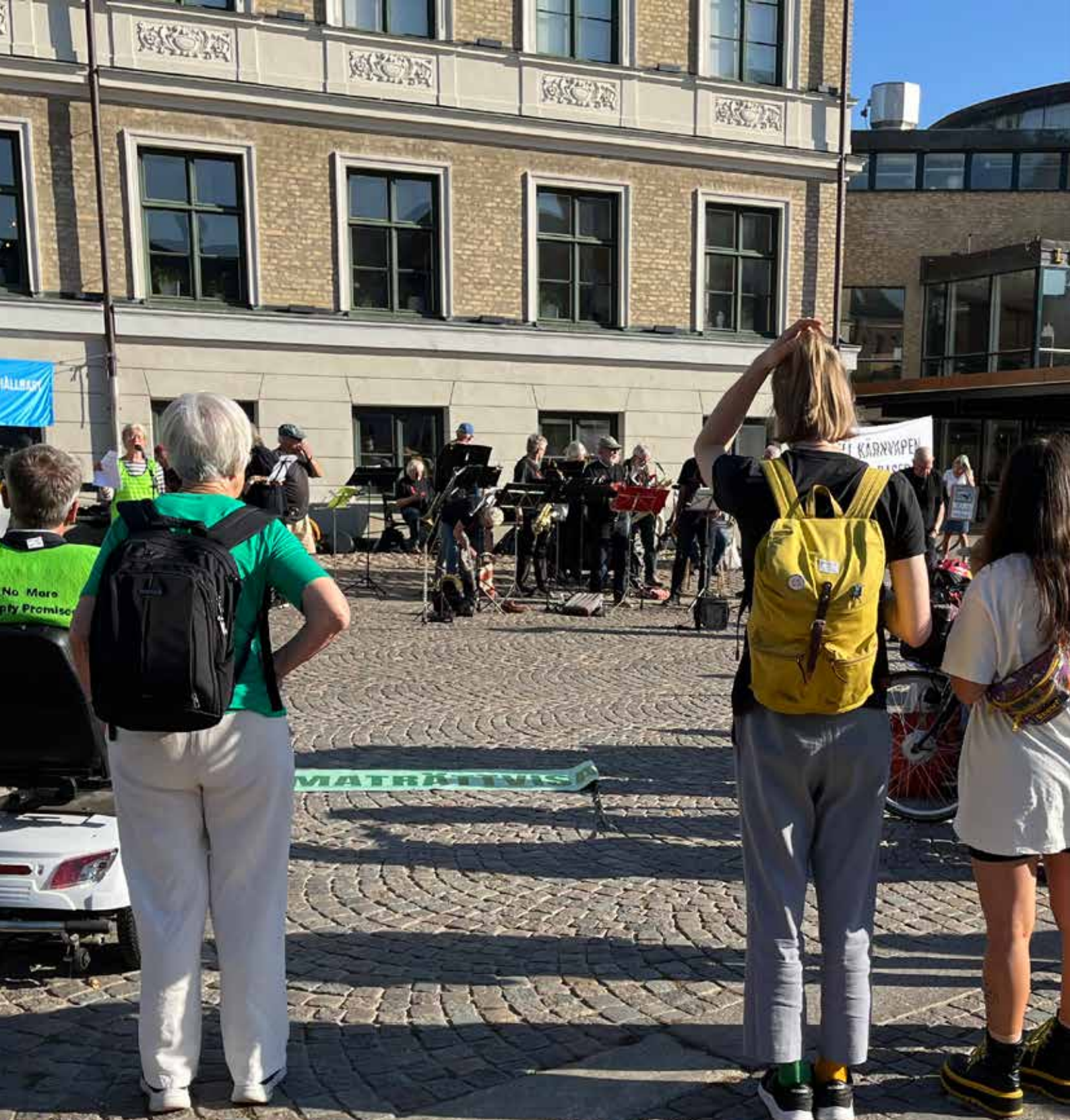
Meeting and a demonstration in Lund 20/9 #NowFor Future! - Tomorrow's too late