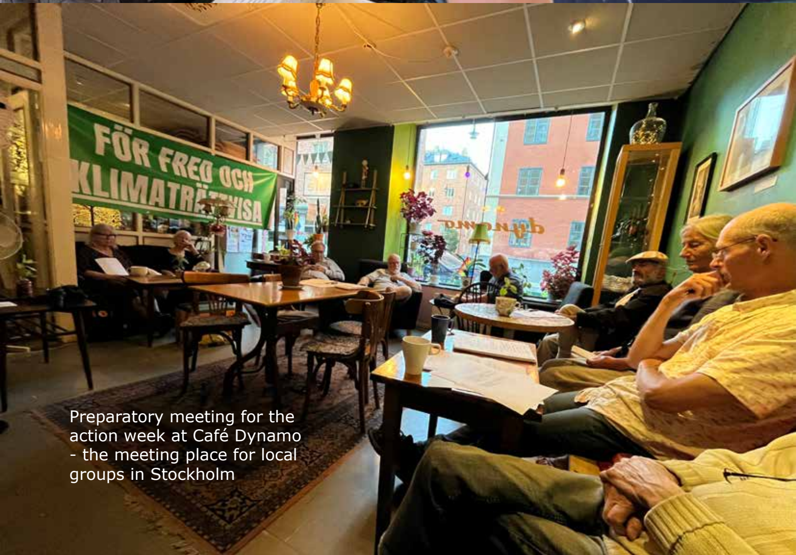
Preparatory meeting for the action week at Café Dynamo - the meeting place for local groups in Stockholm