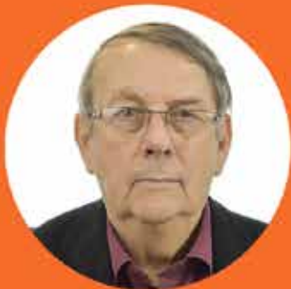
Pär Granstedt fd riksdagsledamot