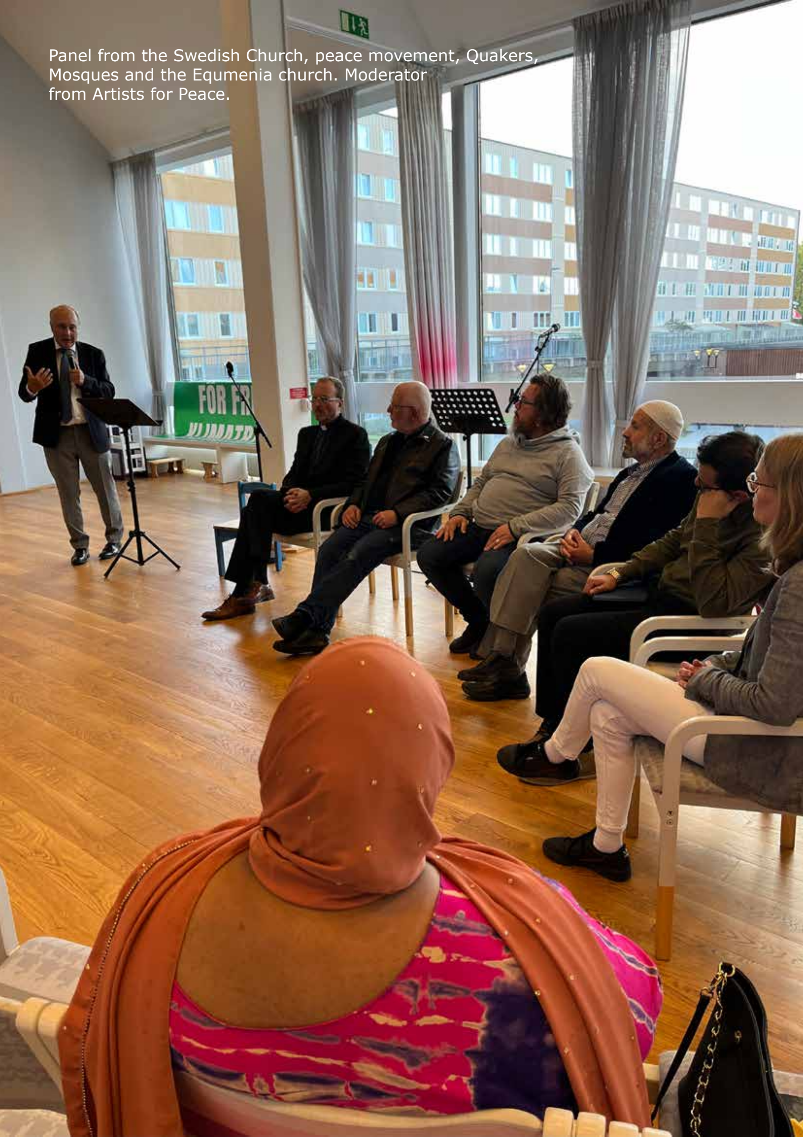
Panel from the Swedish Church, peace movement, Quakers, Mosques and the Eumenia church. Moderator from Artists for Peace.