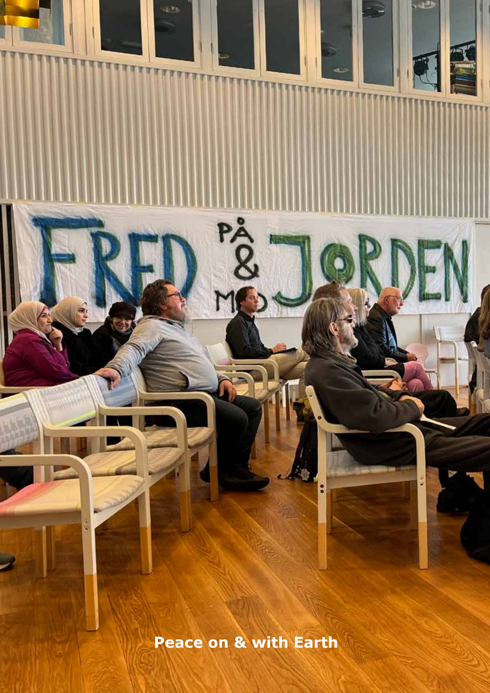
Peace on & with Earth