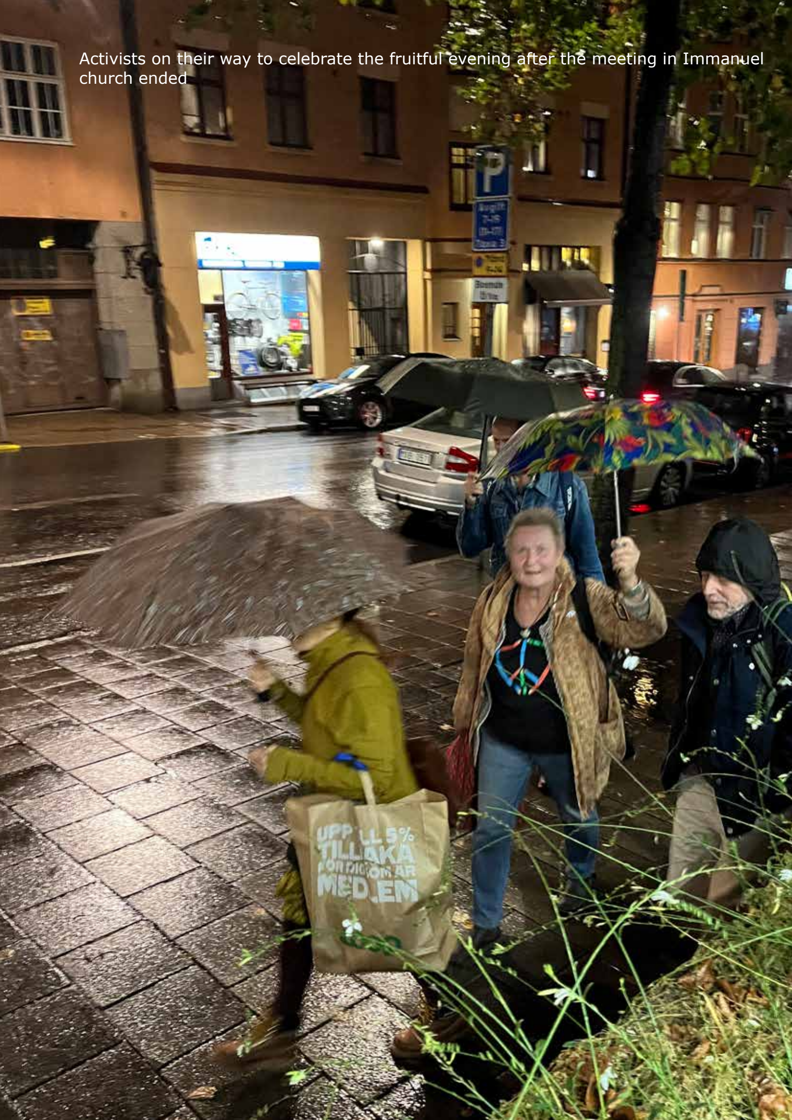
Activists on their way to celebrate the fruitful evening after the meeting in Immanuel church ended