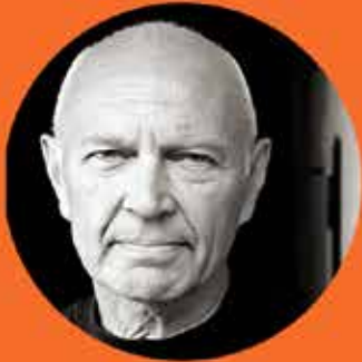
Pierre Schori fd FN ambassadör

kl 17:30 23/9 Café Blå, Lunagallery Södertälje Stadsbiblioteket